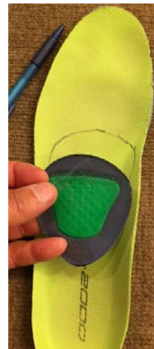
5. Peel of adhesive backing and apply to shoe insert.