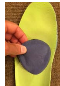
2. Place pad in position on shoe insert.