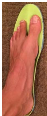
3. Stand on insert, adjust location of pad until maximal relief (see page 1 for more details). Put the insert back in your shoes and walk on it for awhile to make sure it is in a good location.