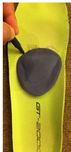
4. Outline pad's final position