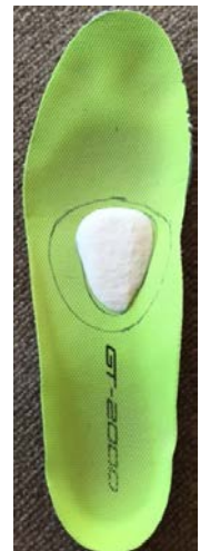
6. Final position of pad and outline comparing sizes.