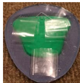
1. Apply double sided tape or rolled tape to undersurface of pad