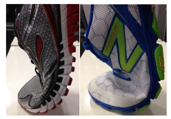
Flexibility of the midsole