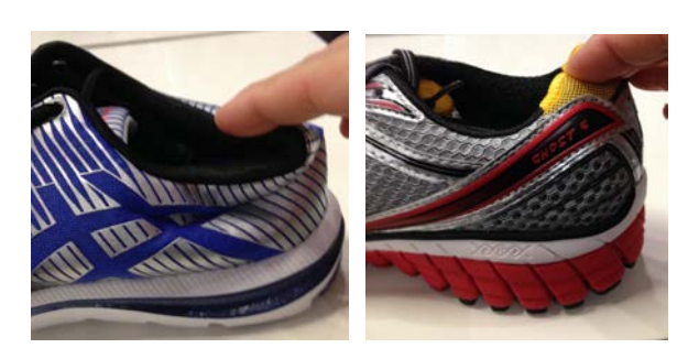
Flexibility of the heel counter